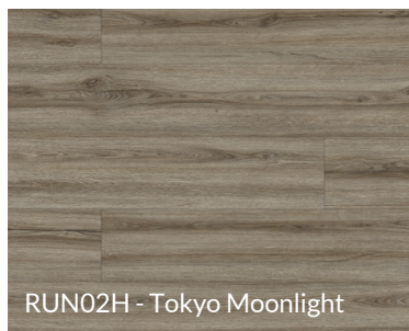
RUN02H - Tokyo Moonlight