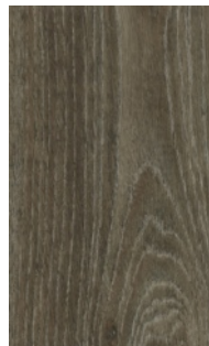
ARDEN OAK 7.25" width