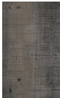
SANTORINI OAK 7.25" width