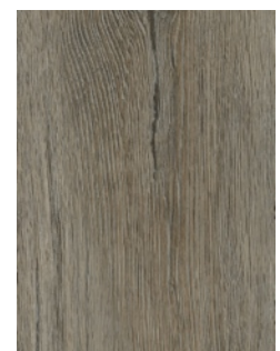
SABA OAK 9" width