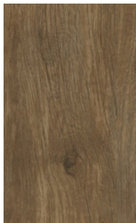
PEMBA OAK 7.25" width