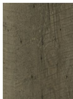
BORA OAK 9" width