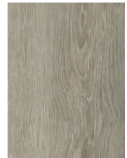
CAYMAN OAK 9" width