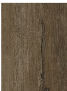
BURANO OAK 9" width