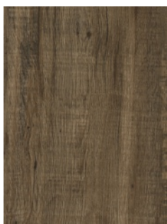
BALI OAK 9" width